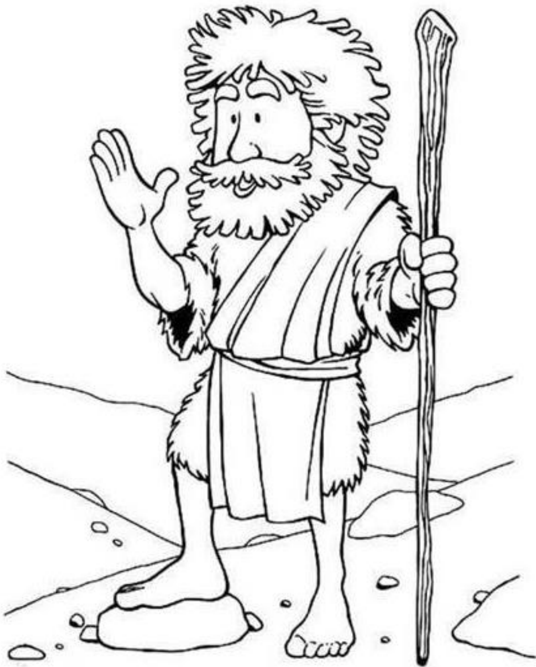
JOHN THE BAPTIST

Second Sunday of Advent: "Make a Fresh Start" Colour in the picture of St. John the Baptist