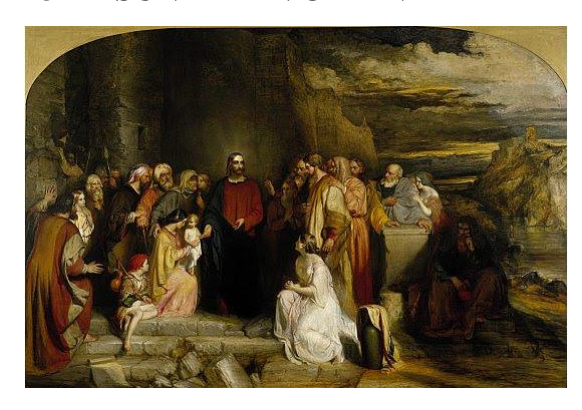
"Whoever exalts himself will be humbled, and whoever humbles himself will be exalted." -Matthew 23.12